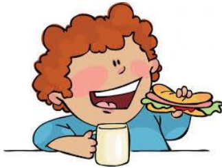
TABLE MANNERS MATCH UP