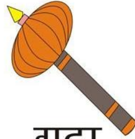
गदा Gada (Mace)